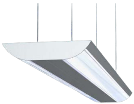
Other format options available upon request