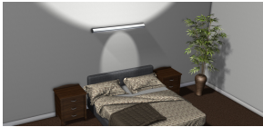
Other Configurations available upon request